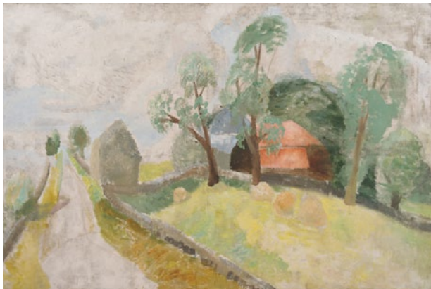
Winifred Nicholson, Roman Road (Landscape with Two Houses) , 1926. © Trustees of Winifred Nicholson.