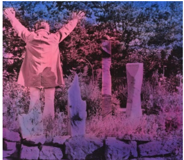
Li Yuan-chia, Untitled , 1993, hand-coloured black and white print.

Press view: 10 November 2023, 10.45am – 1pm