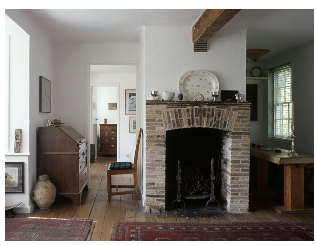
Kettle's Yard House